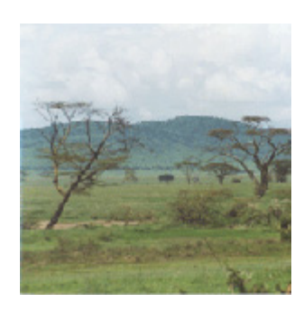
Spot the leopard!