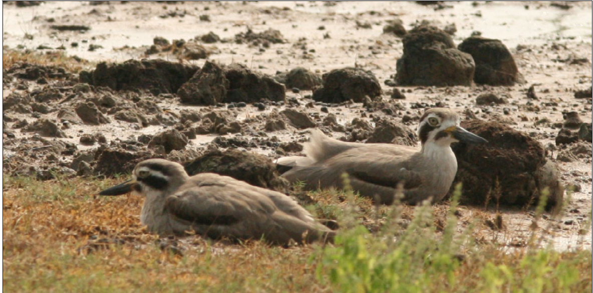
Great Thick-knees at Bundala NP