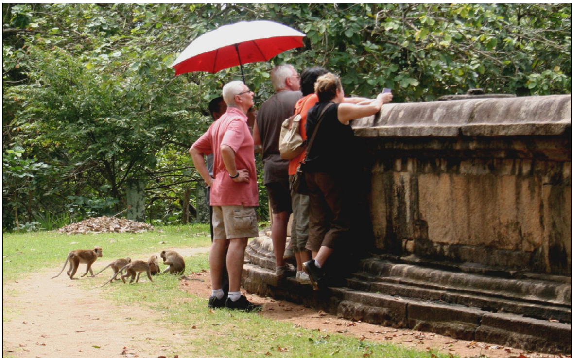
Two of the very common primate-species regularly recorded around cultural site on Sri Lanka.

Note the typical occurrence in dense, strictly species-specific flocks!