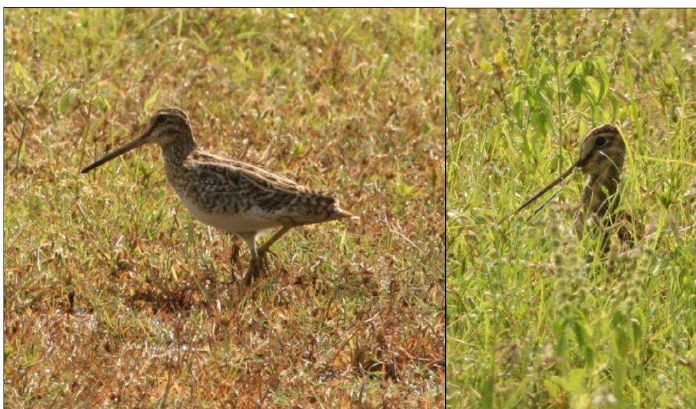
Possible Swinhoe's Snipe (left) and probable Pintail Snipe (right)