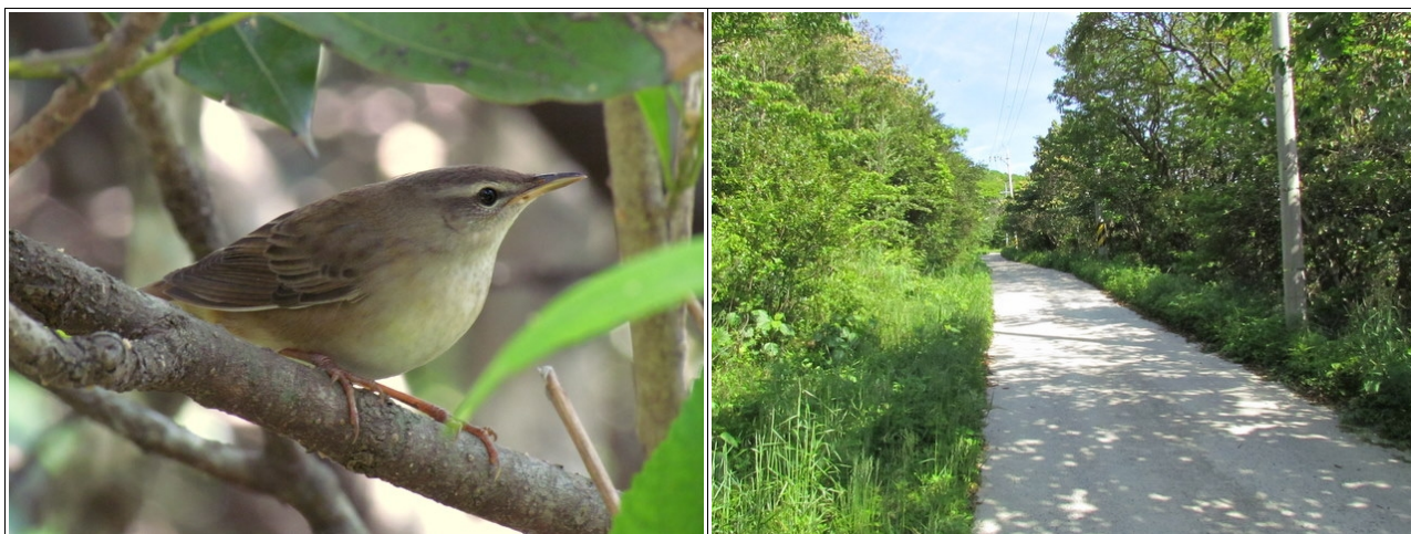
Several Locustella -warblers, like this Middendorff's Warbler were feeding in roadside ditches on Gageo-do.

Gageo-do: 1 bird 28 May, 2 on 30 May, all along the forest edge towards the radar station, where many other locustella -warblers were feeding in the ditches.