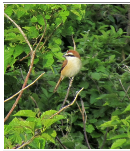
Brown Shrike ♂ ssp lucionensis , Tiger Shrike ♀ and Brown Shrike ♂ ssp superciliosus .

Socheong-do: 17-25 May 11-15 birds recorded daily, with a peak of 19 on 23 May. Only 5 seen 26 May. The majority of birds were ssp lucionensis (and confusus ?), but 2♂♂ ssp superciliosus were seen on 17 May and 1♀ on 19 May.