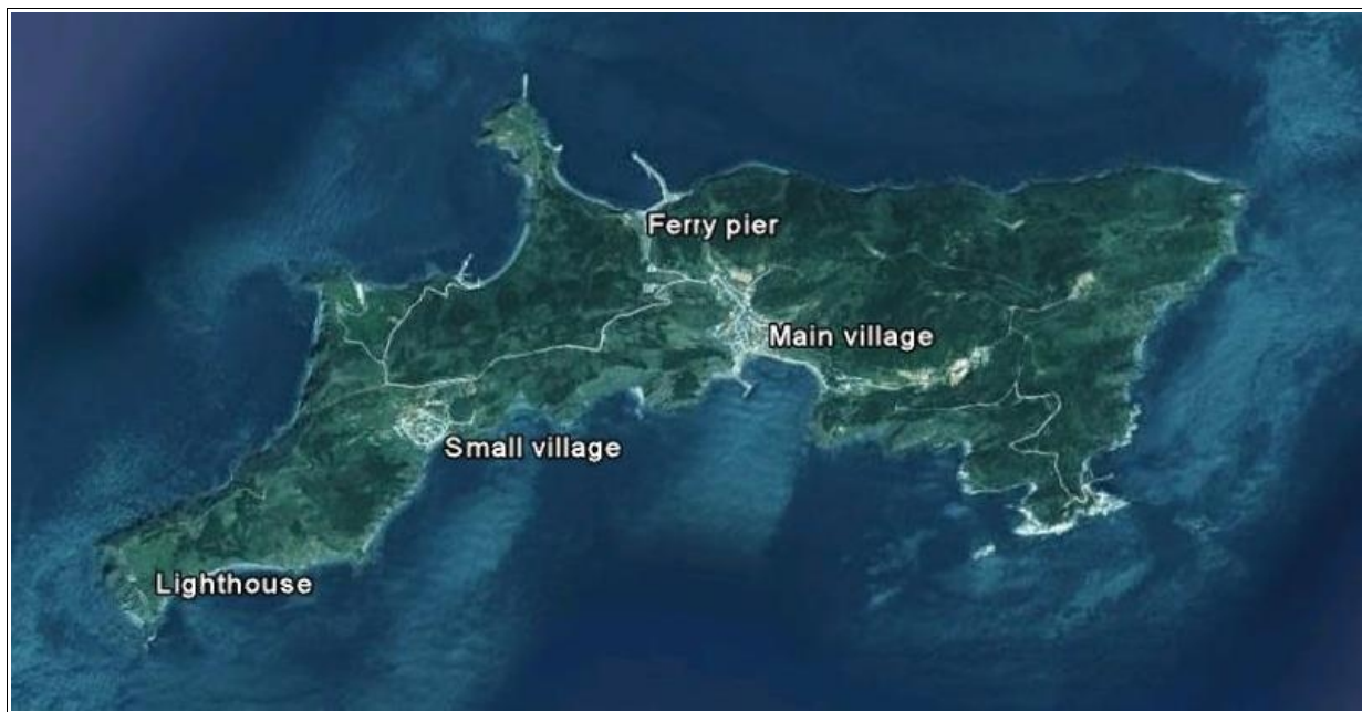
Google Earth-view of Socheong-do.

There are 3 daily ferries, leaving from the Yeonan pier in Incheon, at 8.00 am, 8.50 am and 1.00 pm (51.600 KRW, 3.5 hours and the first stop), and in the other direction leaves Socheong-do for Incheon at 8.30 am, 1.30 pm and 2.30 pm. On Socheong-do I found accomodation in a minbak in the main village, found by turning right, up a short alley where the main road from the ferry pier meets the seafront (look out for an orange sign above the door, see picture below). At the entrance to the alley, there was a small convenience store in a house with green roof (bisquits, beer, snacks). Prices at the minbak were 30.000 KRW/night and 5.000 KRW/meal ( siksa ), including a discount for the long stay.