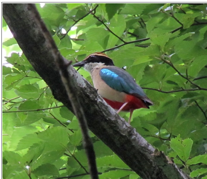
Hair-crested Drongo, Socheong-do and Fairy Pitta, Jeju.

Jeju: 1 ♀ seen and two birds heard in Hallasan NP on 2 June, a pair recorded near Seogwipo on 3 June and two birds heard in the north of Jeju on 4 June. Rather heavily marked striping on breast and belly, is more reminiscent of populations in Japan than birds from mainland Korea.