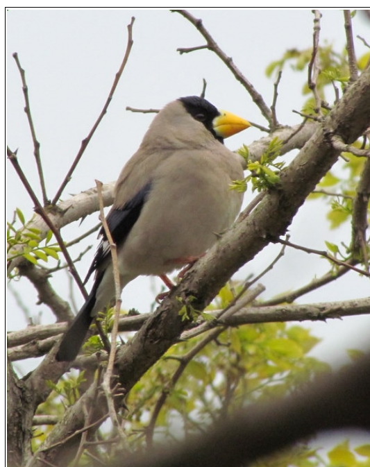
Chinese Grosbeak and Japanese Grosbeak.