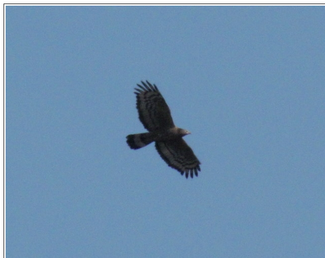
Small numbers of migrating Grey-faced Buzzards and Oriental Honey Buzzards were seen.

Socheong-do: single migrating birds seen on five days 20-26 May.