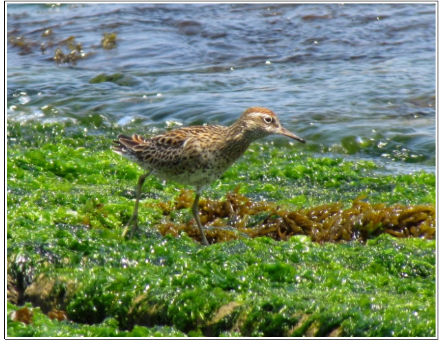
The ramp in the harbour of 1-Gu on Gageo-do was the 'best' spot for waders on my trip, incl. Sharp-tailed Sandpiper.

Socheong-do: singles 21-25 May, except two birds on 24 May.