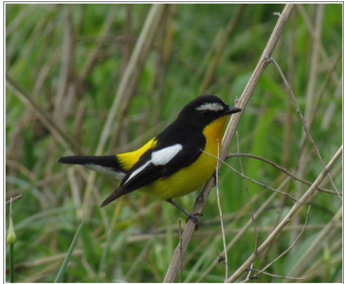
Not all migrants were dull and featureless – White-throated Rock Thrush ♂ and Yellow-rumped Flycatcher ♂.

Socheong-do: approx. 5 breeding pairs along the coast, seen daily.