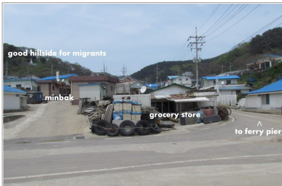
Street-view, looking north from the seafront in main village on Socheong-do.

There are 3 daily ferries, leaving from the Yeonan pier in Incheon, at 8.00 am, 8.50 am and 1.00 pm (51.600 KRW, 3.5 hours and the first stop), and in the other direction leaves Socheong-do for Incheon at 8.30 am, 1.30 pm and 2.30 pm. On Socheong-do I found accomodation in a minbak in the main village, found by turning right, up a short alley where the main road from the ferry pier meets the seafront (look out for an orange sign above the door, see picture below). At the entrance to the alley, there was a small convenience store in a house with green roof (bisquits, beer, snacks). Prices at the minbak were 30.000 KRW/night and 5.000 KRW/meal ( siksa ), including a discount for the long stay.