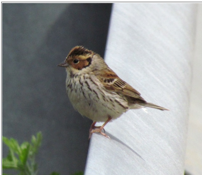
Pechora Pipit, Gageo-do and Little Bunting, Socheong-do.