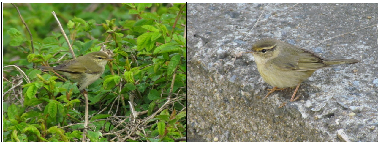
Arctic Warbler and Radde's Warbler - common migrants on Socheong-do.

Socheong-do: singles recorded on 17, 22 and 25 May.