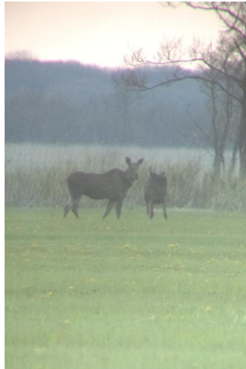
Pics. 13-14. Elks in all ages at Matsalu National Park