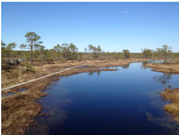
Pics. 11-12. Boardwalking in Kakerdaja Bog.