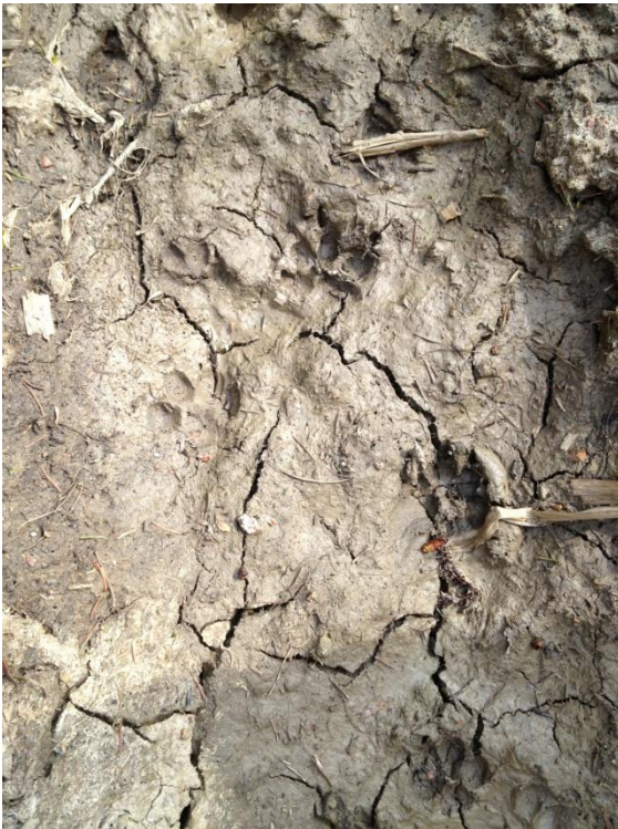
Pic. 27. Tracks of Raccoon Dog