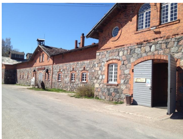
Pic. 29. Lunch break in Järeda.