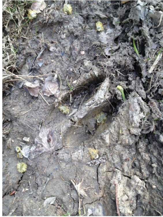
Pic. 26. Tracks of Elk