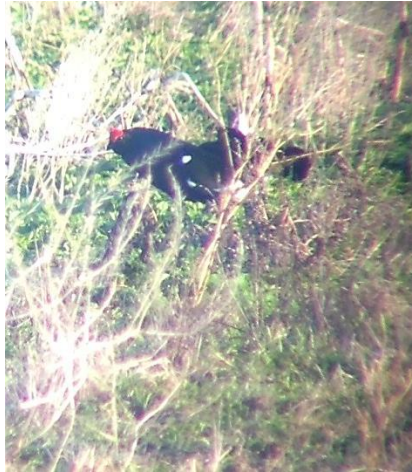
Pic. 2. Black Grouse displaying near Maidla

Eurasian Beaver 1 adult seen very well in a ditch along a forest road. Due to the steep banks the animal was trapped in the low water in which it was walking! Twice it tried to scare us by splashing its tail. It was first seen at 50 m distance but then photographed down to only 3 m! We enjoyed the animal during 15-20 minutes or so before we left it.