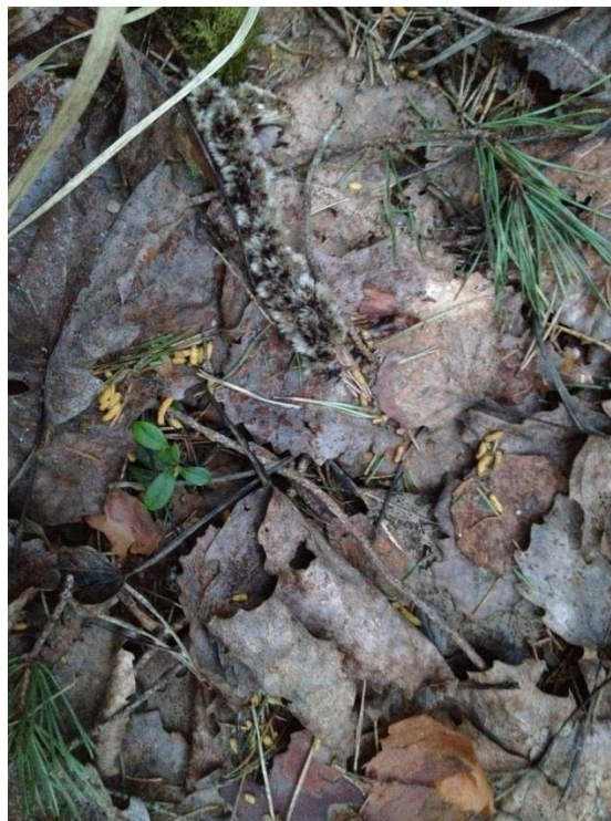
Pic.1. Small droppings (yellow) from Flying Squirrel