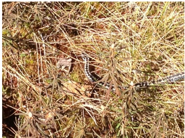
Pics. 9-10 Common Viper.