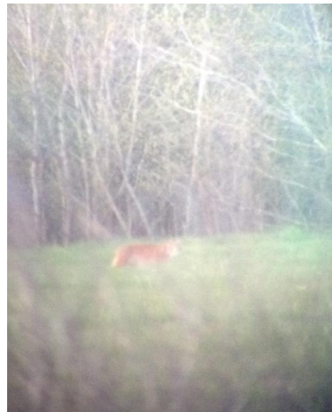
Pics. 15-18. European Lynx south of Panga.

White-fronted Goose 50, Barnacle Goose 5000, Marsh Harrier 1, Thrush Nightingale 1, Great Reed Warbler 1 singing Kideva, Carrion Crow 5