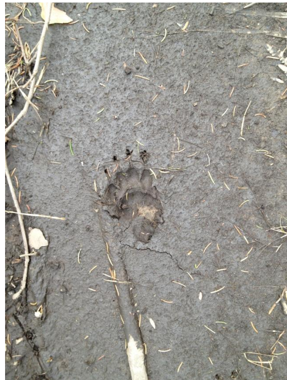
Pic. 28. Tracks of Badger