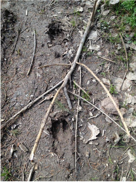
Pic. 25. Tracks of Wild Boar