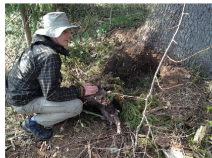
Pics. 19-24 Bear-tracking in Alutaguse.