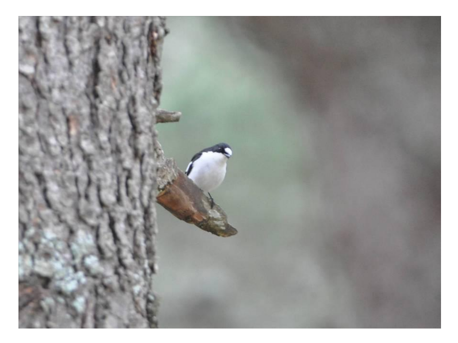
Moussier's Redstart Phoenicurus moussieri 29/04/2012 - Oukaimeden - +/- 10 04/05/2012 - Areas near Ifrane and Azrou - 2 males

04/05/2012 - Areas near Ifrane and Azrou - 3 males and 2 females 05/05/2012 - Dayet Aoua - 1 pair