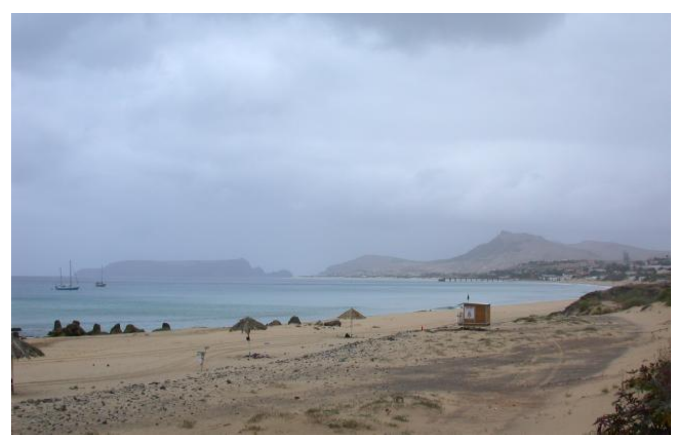
Almost Bounty Land, Porto Santo

Porto Santo – Funchal. 19.10 – 21.20. The last bit along the Madeiran coast was in the dark. Bulwer's Petrel 327, Cory's Shearwater 600, Yellow-legged Gull 200, Common Tern 6 [Dolphin sp. 2].