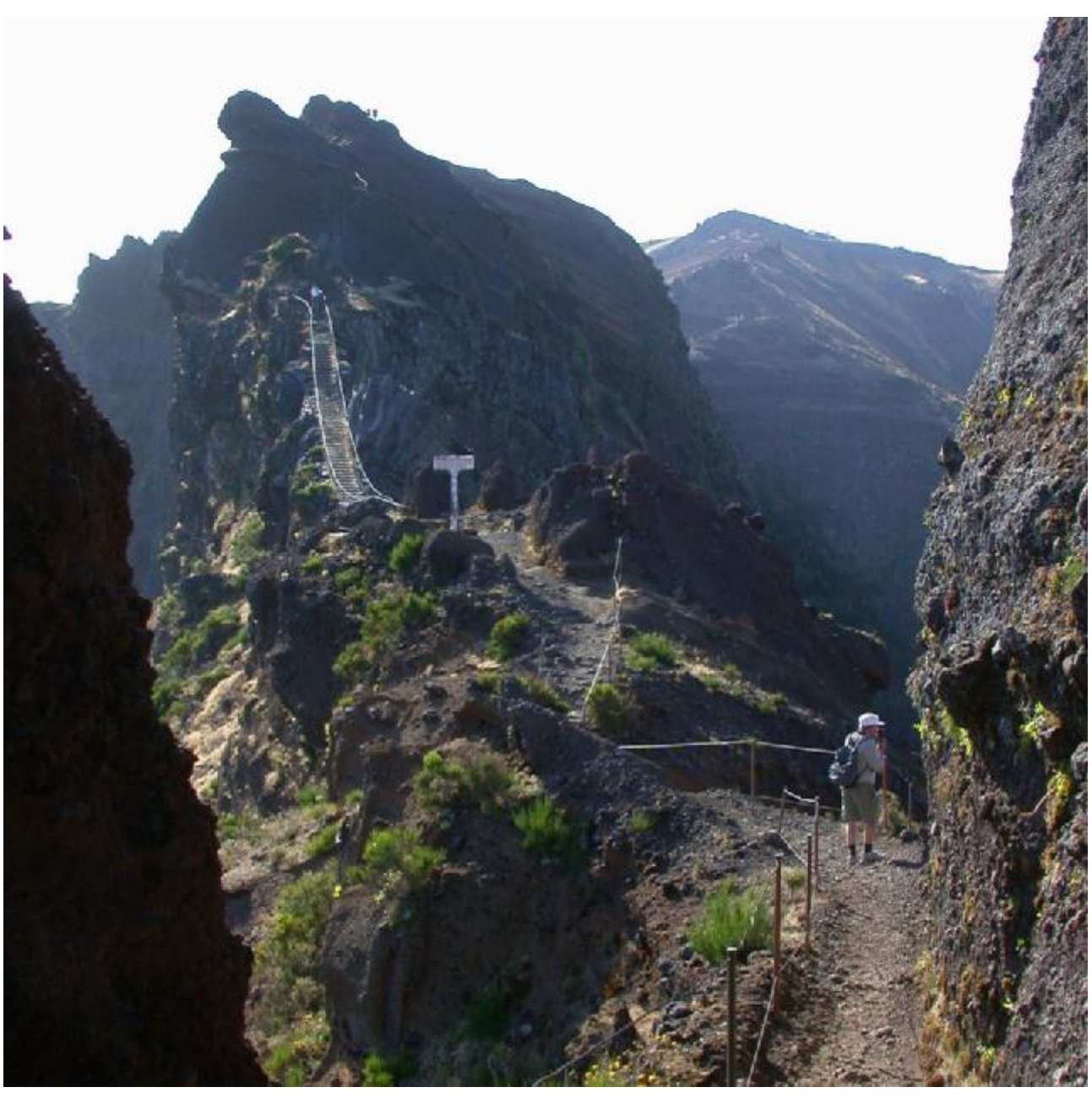
Did we walk there in pitch darkness?