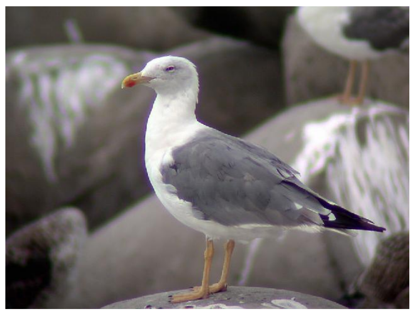
Yellow-legged Gull (Atlantis' type'), Funchal Harbour