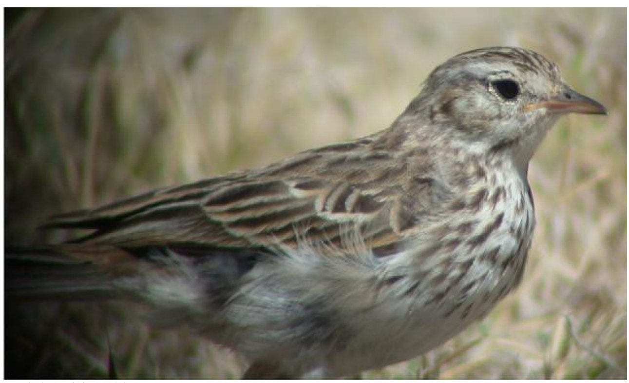
Berthelot's Pipit, Praínha

9 Praínha, 4/2 Ponta do Pargo, 14 Porto Santo, 6 Pico do Arieiro, 11 Ponta de São Lorenço.