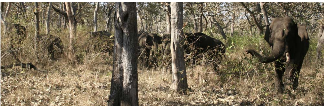
Mudumalai 3/2.