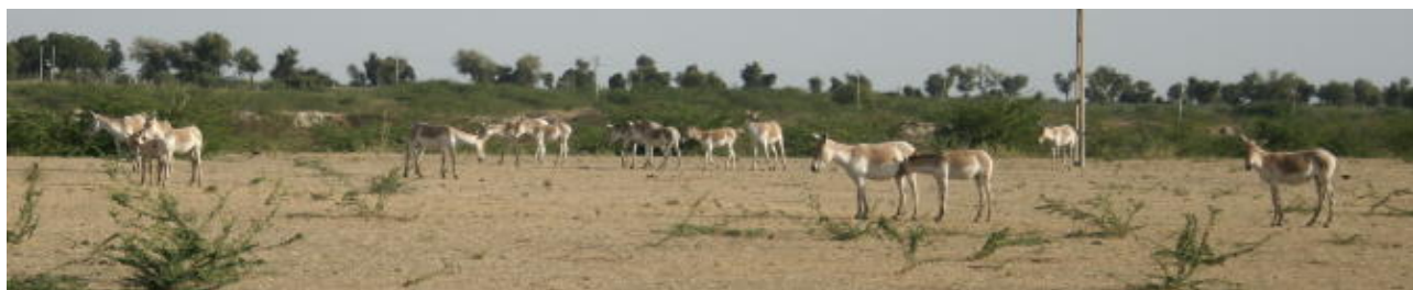
Little Rann of Kutch 15/2.

Strikes seem not be an uncommon theme in Southern India and they may cause unforeseen problems. A strike in the transport sector of Kerala on the 25 th of January forced us to rush to the Eravikulam NP late in the afternoon on the 24 th as access to the Park was unlikely on the following day. Our drive to Kochi on the 25 th was only initiated during the afternoon when the driver and lodge-manager felt it was possible to reach Kochi without problems. The strike had an obvious impact as we drove on nearly empty roads almost until Kochi. Later in Karnataka a general strike was close to blocking our last two days. Negotiations related to an interstate agreement btw Karnataka, Tamil Nadu and Andhra Pradesh of how to share use of water in the rivers caused outspoken discontent among farmers in Karnataka. When the problem became imminently threatening we checked up on information at hotels, newspapers etc. whenever possible. We were just about to cancel our planned programme for the last two days for a stay at some hotel near the airport in Bangalore. However, on grounds of a four day long Aero India show in Bangalore with international attendance the strike was delayed from Friday to Monday, when we (and other visitors) were well out of the state.