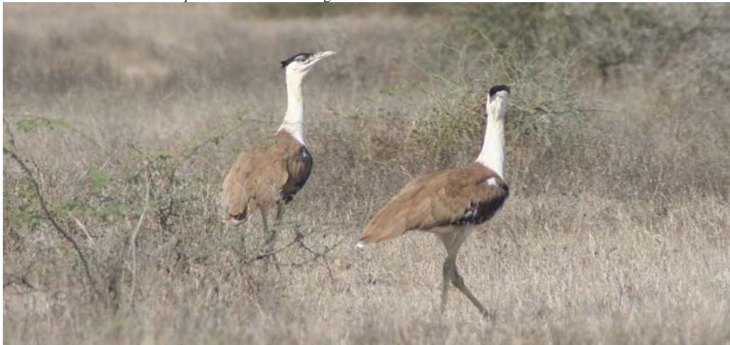
Pingleshwar 11/2.