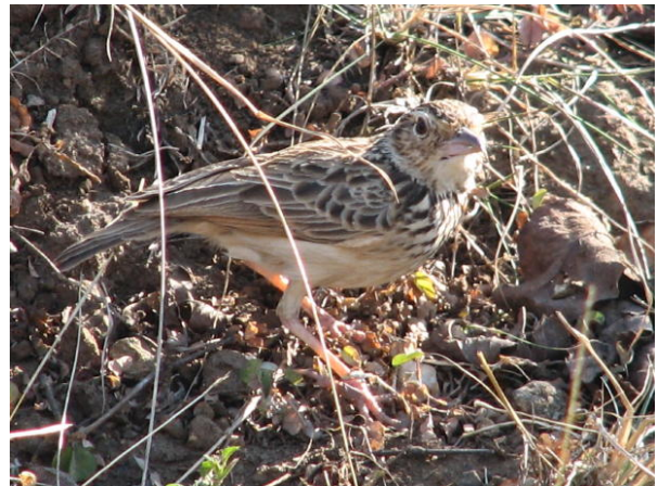
Jerdon's Bushlark at Mudumalai. A very long-legged bird.