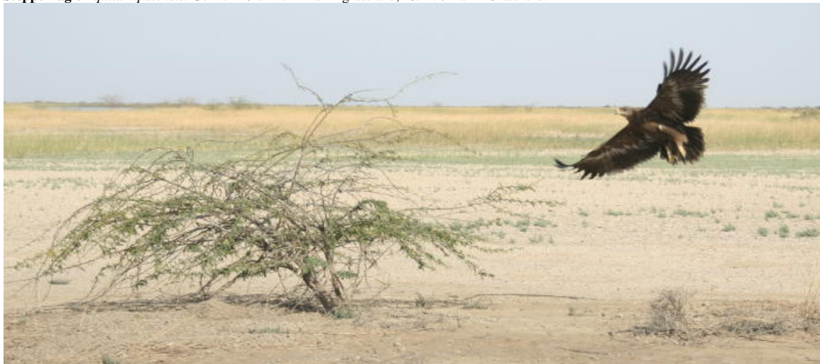
Banni grassland 13/2.