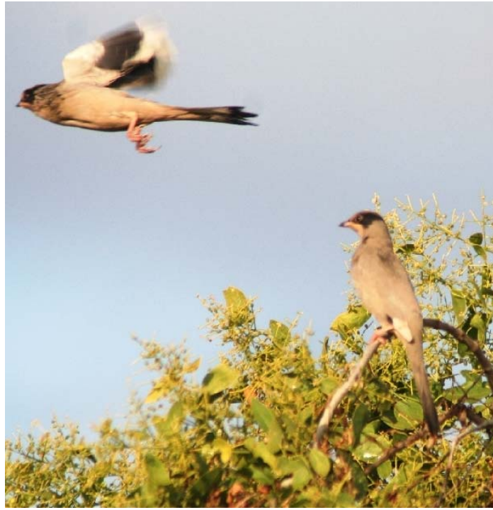
Fulay 10/2. Grey Hypocolius.