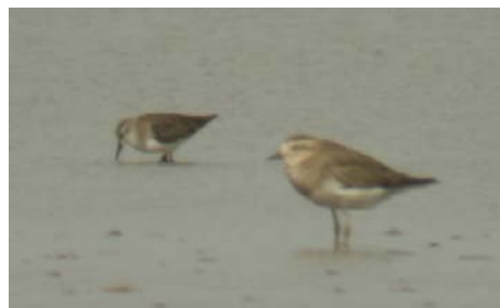
The quality of the photo not the best but it was disgisoped with my handheld reflex camera.

A highly unexpected record: There seems only to be few previous records from the Subcontinent. Details will be published elsewhere. The bird was seen resting inactively at the transition between mudflat and permanent water in a saline lake. Thousands of other waders were actively feeding around the bird. All birds were disturbed and the Caspian Plover could not be relocated. Seen together with Mongolian Plover, Marsh Sandpiper and Little Stint.