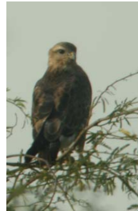
Banni Grassland 13/2.

Three of this distinctly small buzzard was seen. None of the recent guides to Indian birds shows the species to occur in Gujarat during winter.