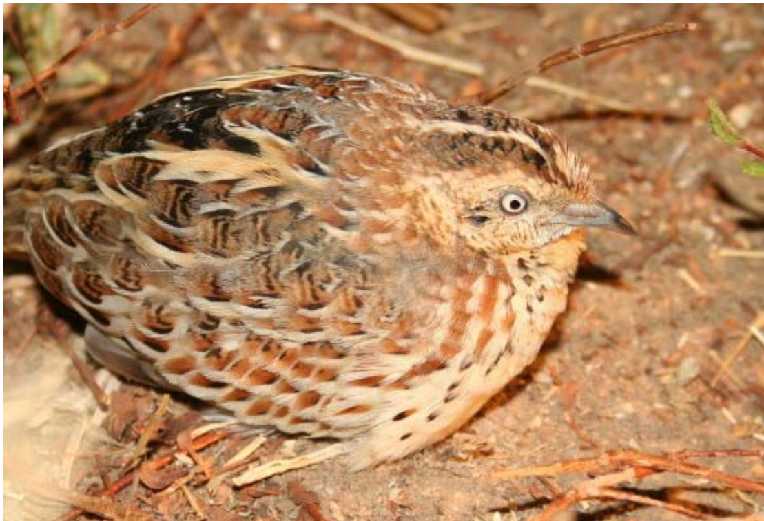
Fields near Zainabad 15/2.