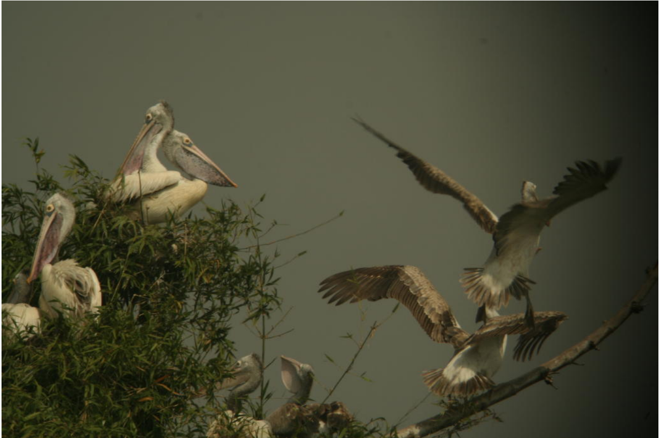
Vedanthangal Bird Sanctuary.