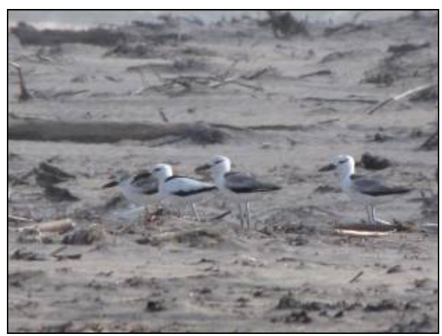
Crab Plovers at Sabaki River Mouth.

Crab Plover ( Dromas ardeola ) one of the trip highlights, after missing the species a few times in UAE. At Mida Creek 51 were at the hightide roost, and at Sabaki River Mouth there was a roost of 85 on the spit, with 127 counted feeding on the mudflats there the following day.