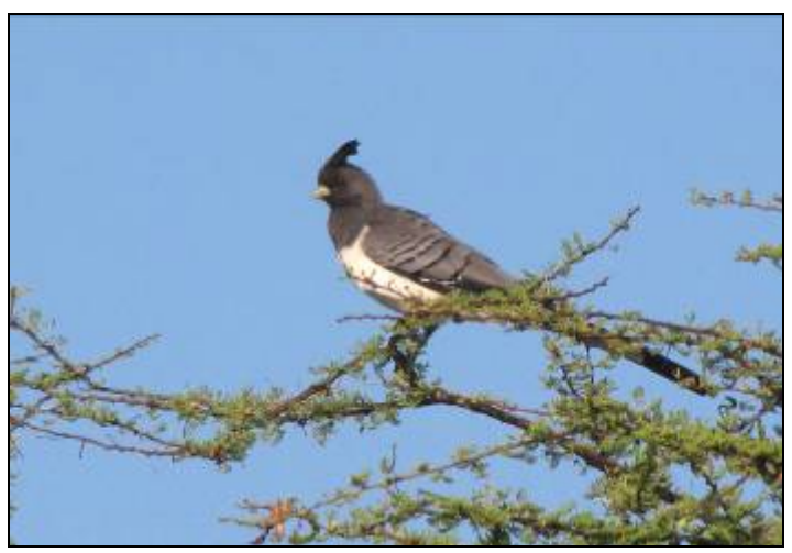
White-bellied Go-away-bird at Sagala Lodge.

White-bellied Go-away-bird (Corythaixoides leucogaster) Sagala Lodge 10+ and Athi River 4.