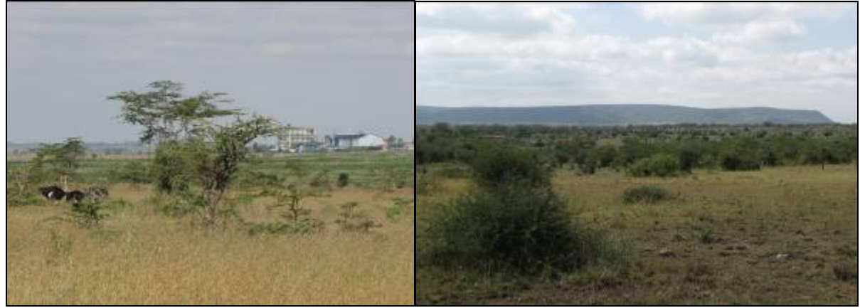
Habitat east of Athi River.

Sabaki River Mouth – on the way to Gongoni, the Sabaki River is crossed 5km north of Malindi, and from the village on the northern side of the bridge, a dirt track leads down towards the coast. The first part is through bush and farmland, before dropping down to the river in front of the outermost, vegetated dunes. Next is an area of extensive salt-marsh with scattered bushes to the north and a band of mangroves towards the river, before reaching the sandy beach at the river mouth, where waders and terms roost on the spit at high-tide.