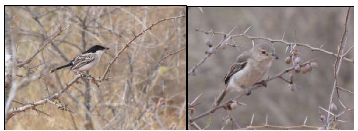
Pringle's Puffback male and female at Sagala Lodge.

Pringle's Puffback (Dryoscopus pringlii) 1-2 pairs seen around Sagala Lodge.