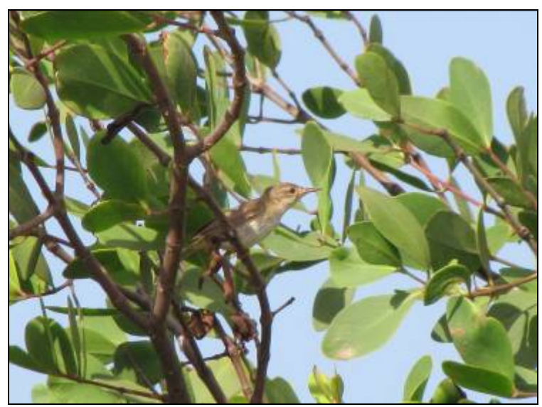
African Reed Warbler at Sabaki River Mouth.

African Reed Warbler ( Acrocephalus baeticatus ) in the mangroves at the Sabaki River Mouth up to two birds were heard singing on both visits, but they didn't look as buffy on the breast and flanks as the the bird of the suahelicus -race depicted in Birds of East Africa. The birds occurring in Somalia of the avicennia -race are supposedly more pale underneath(?).