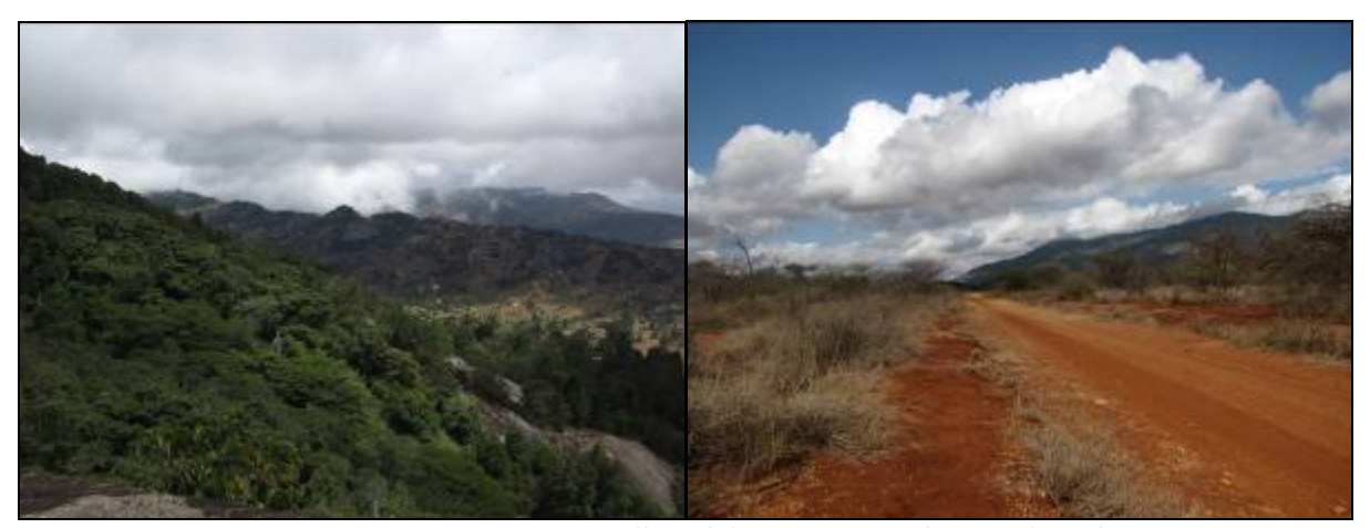
Ngangao Forest, Taita Hills and the entrance road to Sagala Lodge.

The main reason to visit Sagala Lodge is the fact, that it's possible to bird on foot in the scrub, but during my visit elephants were present in the area, so the staff advised me to avoid certain areas. One of the staff – Wilson – is also a good bird-guide, and I went with him one afternoon to the reservoir in the large enclosure.