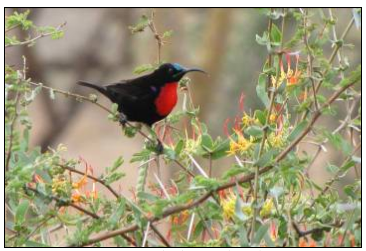
Hunter's Sunbird at Sagala Lodge.

Hunter's Sunbird ( Chalcomitra hunteri ) up to two birds seen daily around Sagala Lodge.