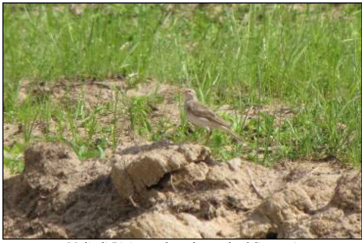
Malindi Pipit at saltworks north of Gongoni.

Malindi Pipit ( Anthus melindae ) at the northern saltworks near Gongoni 5-6 birds were found along the southern edge of the pans, where recently cleared brush bordered grassy meadows. One bird was seen gathering nets-material, and 2-3 males were displaying overhead or singing from a perch.