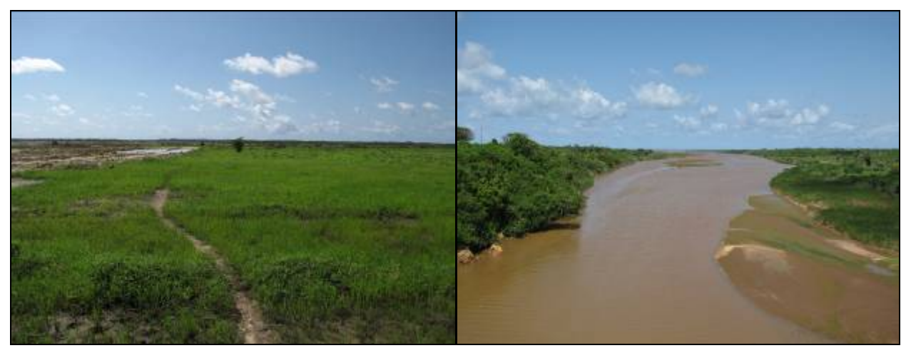
Malindi Pipit habitat near Gongoni and Sabaki River Mouth.

The report by Jon Hornbuckle mentioned a site for Malindi Pipit near a football field north of Gongoni, and I tried finding this place by walking north along the main road. I didn't find the football field, but 3km north of Gongoni a large area had been cleared of brush on the eastern side of the road, just south of another salt works, and on the edge of this area I found several Malindi Pipits.