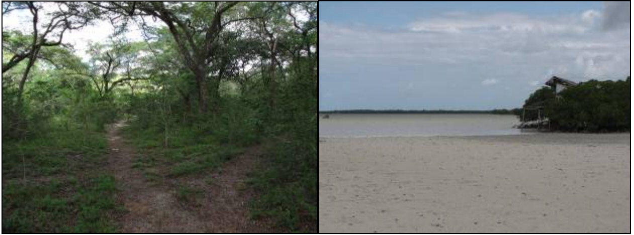
Brachystegia forest in Arabuko-Sokoke Forest and the bird hide at Mida Creek.

0723314416/0733971604) who also arranged for a car on one of the days to take us to the western side of the forest around Jilore, for which the driver, Kazungu, charged 4500 KES for a full day. The forest near the Jilore Forest Station is red soil or Cynometra , where the Sokoke Scops Owl is found, and is approx. an hours drive away from Gedi.