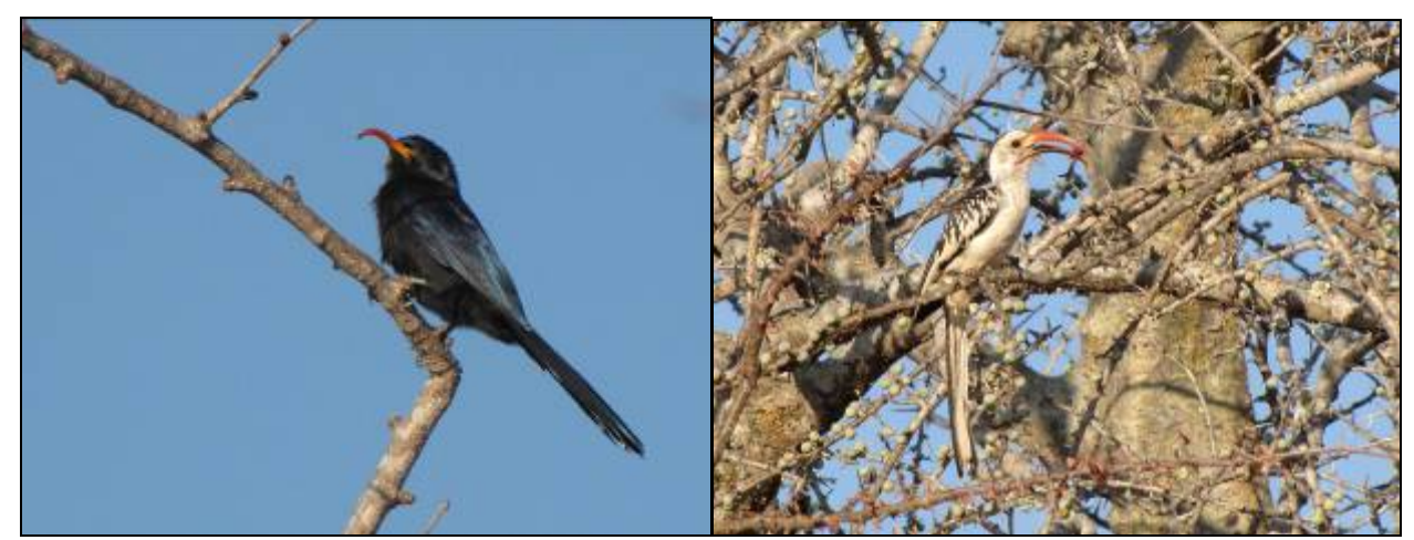
Abyssinian Scimitarbill and Red-billed Hornbill, Sagala Lodge

Von der Decken's Hornbill (Tockus deckeni) Sagala Lodge 10+, Athi River 1.