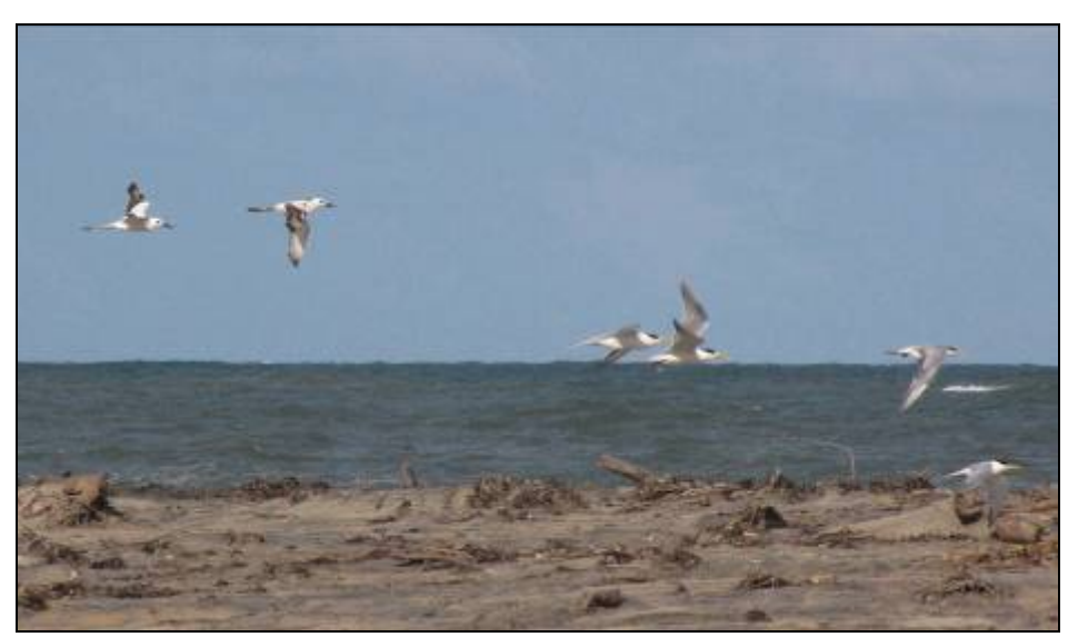
Crab Plovers, Greater Crested and Lesser Crested Tern, Sabaki River Mouth.

Lesser Crested Tern ( Sterna bengalensis ) 2 birds at Mida Creek, and approx. 200 birds roosting on the spit at Sabaki River Mouth.