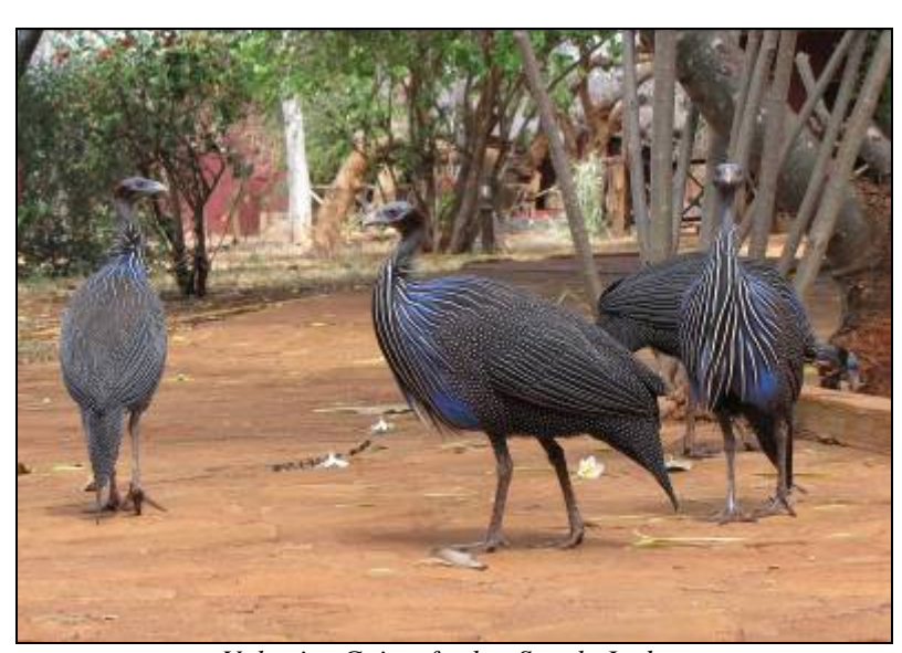
Vulturine Guineafowl at Sagala Lodge.

Vulturine Guineafowl ( Acryllium vulturinum ) at Sagala Lodge a group of 25-30 birds came in to feed around the lodge several times daily, usually being served scraps from the kitchen.