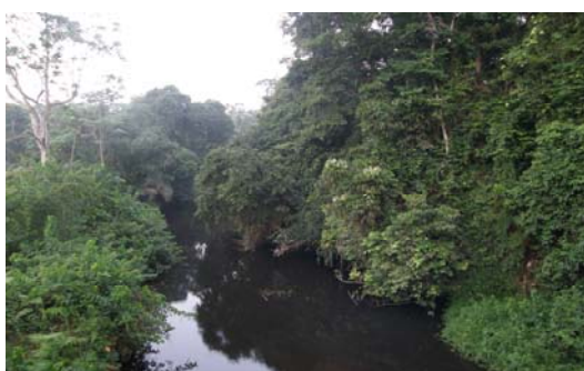
The river at the Ankasa NP gate (NSR)

During the walk back to the car, half way to the entrance, we saw the bird of the day: Three guineafowl were flushed in the forest floor next to the road, and they turned out to be the rare White-breasted Guineafowl, formerly considered extinct in Ghana in 1952. What a surprise! Back to Axim to our hotel, where we enjoyed a nice dinner evening and talk with the friendly staff.