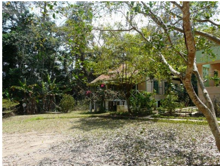
The pleasant lodge in Bobiri Forest (ARO)

The forest was completely dried out and steaming hot, about 32 degrees celcius! Very few butterflies, and bird life was very quiet, accordingly, but still we managed to see quite a lot of good species during our afternoon and evening walk. The highlight was a stunning Black Dwarf Hornbill, giving prolonged scope views while sitting quietly in the open forest. African Green Pigeons were everywhere, Whitethroated Bee-eaters, African Pied Hornbills, a breeding pair of Grey Kestrels, Ansorge's Greenbul, Forest Wood Hoopoes and Senegal Parrot. At dusk, a Brown Nightjar was calling, and we heard the shriek of a Potoo in the distance.