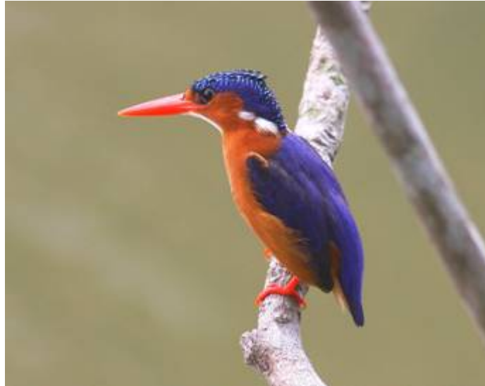
Malachite Kingfisher at Hans Cottage Botel pond (EKR)

9/2: 1 at the river at the entrance of Ankasa National Park. 10/2: 1 same place.