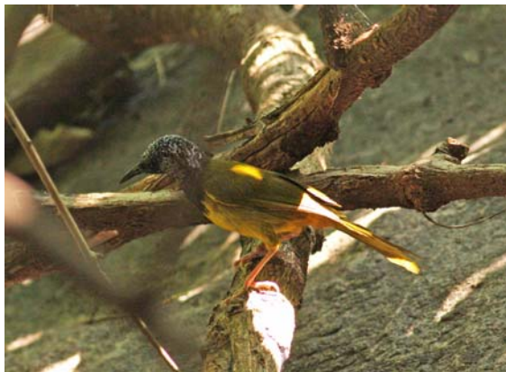
Oriole Warbler in Shai Hills