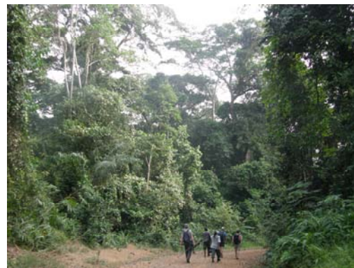
Birding in Ankasa NP (NSR)