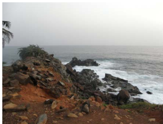
Cape of Three Points, the southernmost point in Western Africa (NSR)

We finally arrived in Axim, and ended a long day with a late meal at the nice beach hotel. Hans fell out from his open, unfenced edge at his cottage veranda in the pitch dark night, falling several meters down and got rather injured, but he did not speak much about it.