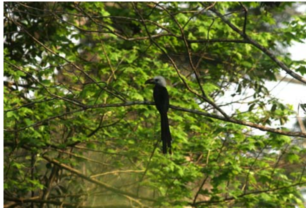
White-crested Hornbill at Antwikwaa (EKR)

Birding this last morning on canopy walk was delayed a bit, due to rain, so we were not in place until 7:40. But it cleared up, and we had a wonderful morning, birding from the different platforms until 11:20 a.m. Platform no. 3 seems to be the most rewarding, giving a good view over the forest. As new forest birds to our list was a flock of Forest Francolins calling from the forest floor, a Shrike Flycatcher and a flock of Forest Wood Hoopoes (heard only). Grey Parrots flying over, a magnificent Congo Serpent Eagle passing by, Blue Cuckoo Shrike, Redfronted Parrots, gorgeous Buff-throated Sunbirds, Redbilled Helmet Shrikes, Slenderbilled Greenbuls, Fraser's Sunbird, Chestnut-capped Flycatchers and a heard Brown Illadopsis all contributed to a rewarding birding morning. Best experience of the morning, however, was a flock of Black and White Colobus Monkey in a tree – definitely one of Africa's most attractive primates.