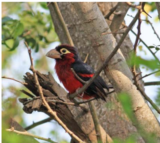
Double-toothed Barbet at Sakumo Lagoon (EKR)