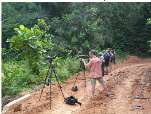
Watching Hartlaub's Ducks (ARO)