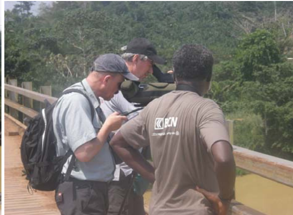
Watching at Pra River (NSR)