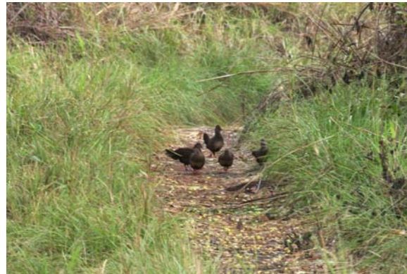
Stone Partridges in Shai Hills