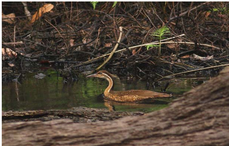
A shy and wary African Finfoot at Ankasa NP (EKR)

10/2: 1 adult female at a roadside pond at Ankasa National Park.