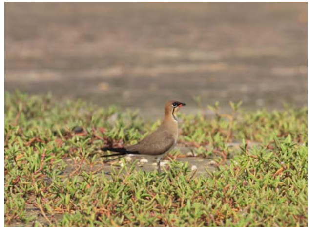
Collared Pratincole at Sakumo Lagoon (EKR)