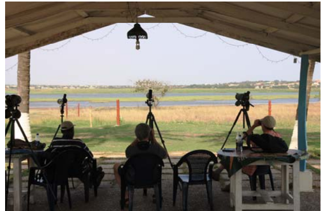
Relaxing at Sakumo Lagoon near Accra (EKR)