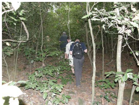
On our way to the rockfowl nesting colony (NSR)