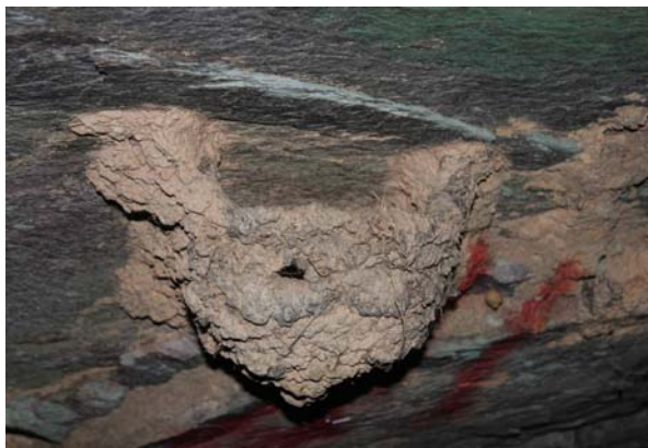
Nest of Yellow-headed Rockfowl (EKR)