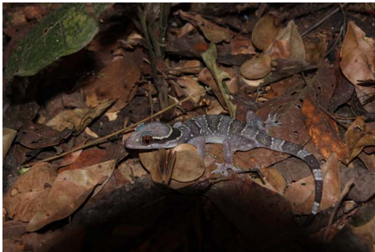
A forest gecko at Kakum National Park (EKR)