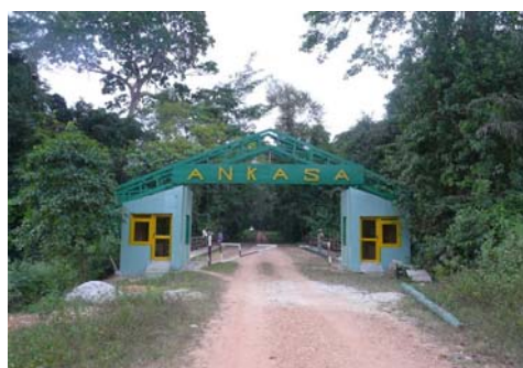
Ankasa NP Gate (ARO)