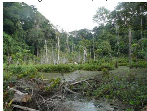
The Hartlaub's forest pond in Ankasa NP (ARO)