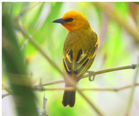
The beautiful Orange Weaver (EKR)

13/2: Three pairs of this beautiful weaver were nesting at the garden lake, Hans Botel Cottage, between Cape Coast and Kakum NP. 14/2: do.