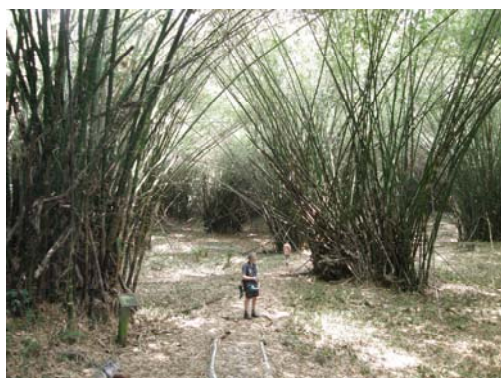
The "Cathedral" at Nkwanta Camp (NSR)