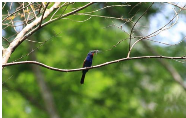
Blueheaded Bee-eater at Atewa Forest (EKR)

11/2: 2 at Canopy Walk, Kakum National Park. 13/2: Excellent views of 2 perched birds at forested areas near Anwikwaa Village, northern Kakum National Park.