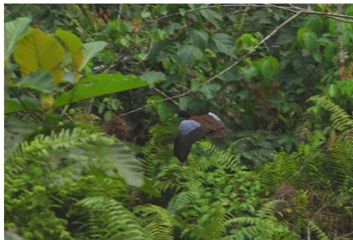
Hartlaub's Duck in Ankasa NP (EKR)

10/2: 6 Ankasa National park. One of the star birds of the trip. Just a kilometre further along the forest road from Nkwanta Camp, there are three waterholes, one after the other, along the left side of the road. In the first small pond there was a pair of this scarce and shy forest duck, and in the last, and larger wetland, no less than 4 birds showed well, among these a pair that flew up and perched in a tree. Make sure to approach these wetlands slowly and quietly, and stay close together, so that everybody will see the ducks before or when they take off.