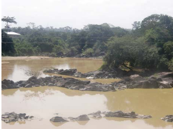
Rock Pratincole site at Pra River (NSR)

The afternoon was spent at the canopy walk, but it did not add much to the list, except for a nice Palm-nut Vulture.