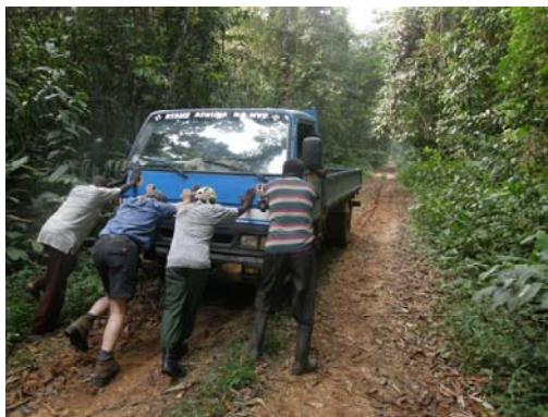
Our reliable truck (NSR)

After dark, we arrived at our next destination, the Hans Botel Cottage north of Cape Coast, close to the famous Kamum National Park.