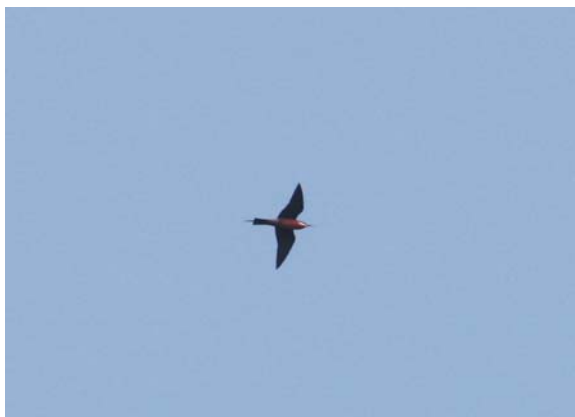
Rosy Bee-eater at Antwikwaa (EKR)