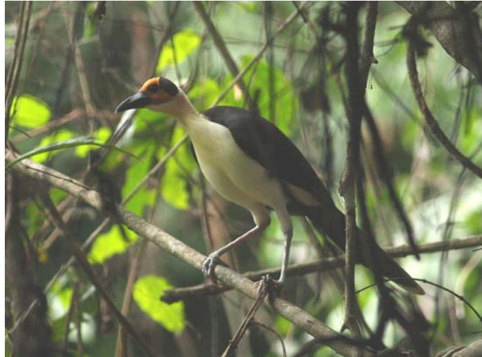
Yellow-headed Rockfowl (EKR)