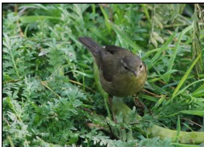
Smoky Warbler (ssp. weigoldi?)