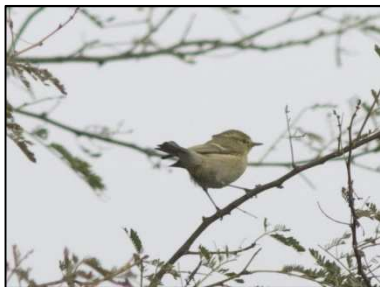
Brook's Leaf Warbler, Bhindawas