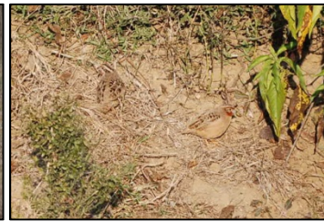
Jungle Bush-quail, Chambal