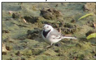
Ssp. baicalensis . Chambal

A few records not specified to subspecies: 31/12 4 Agra, 3/1 2 Chambal river (up-stream), 4/1 10 drive Gwalior to Khajuraho, 16-18/1 + Chambal.