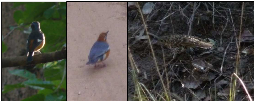
Documentation photos of the three exclusive thrushes seen in Kanha – Blue-capped Rock Thrush, Orange-headed Thrush and Scaly Thrush.