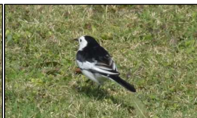
Ssp. leucopsis . Khajuraho

188. *White-browed Wagtail Motacilla madaraspatensis . 2/1 8 Chambal river (down-stream), 3/1 10 Chambal river (up-stream), 6/1 7 Panna Tiger Reserve, 2 Ken River Lodge (Panna Tiger Reserve), 7/1 1 Orchha, 17/1 2 Varanasi, 16-17/1 20+ Chambal river, 27/1 2 Bhindawas lake.