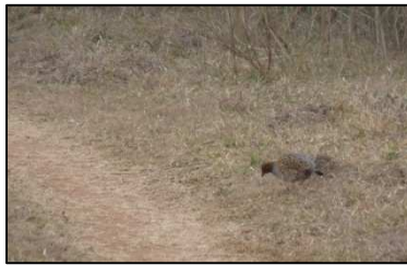
Painted Francolin, Panna