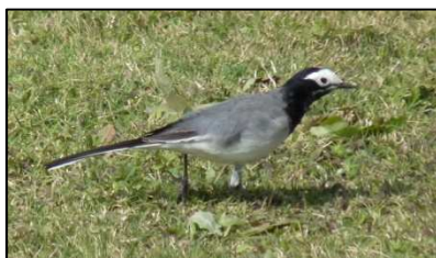
Ssp. personata . Khajuraho