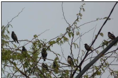
Common & Pied Starlings