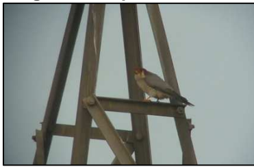
Red-necked Falcon, Chambal