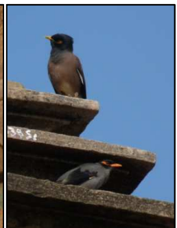
The two city-mynas