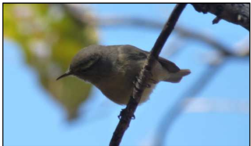
Sulphur-bellied Warbler, Bhimbetka