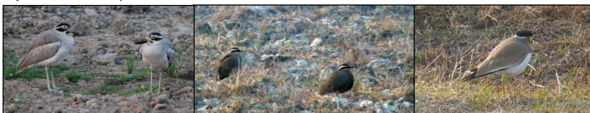
Great Thick-knee, Chambal