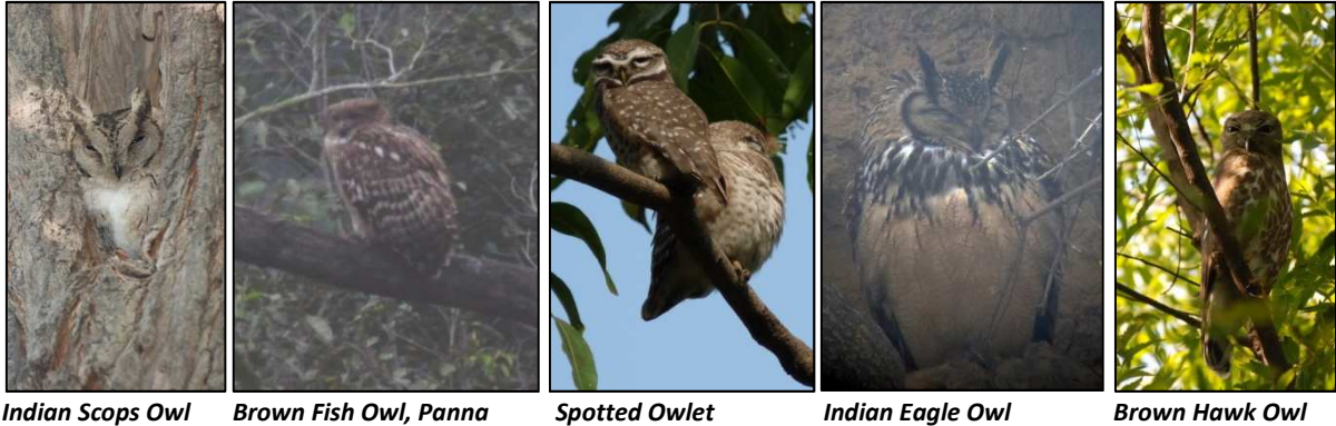
Indian Scops Owl