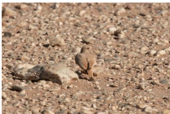
Bar-tailed Desert Lark, Aousserd road km183