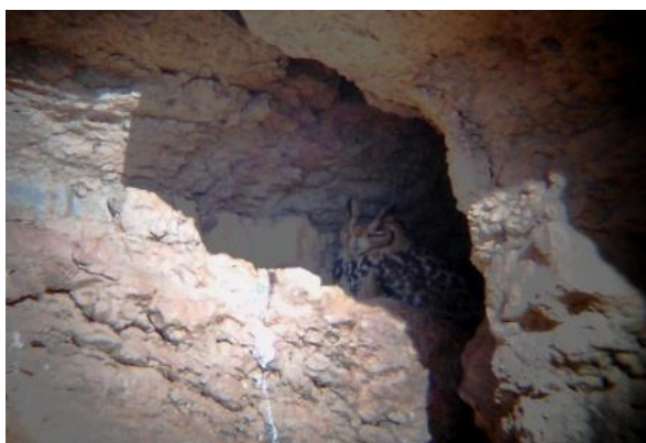
Pharao Eagle Owl, near Rissani