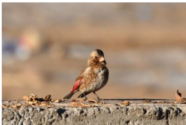
Crimson-winged Finch, Oukaïmeden

The drive to Rabat was long, 2 Cream-coloured Coursers and a Calandra Lark being the highlights, both seen from the car. We checked in at Hotel Les Gambusias in Skhirat Plage.