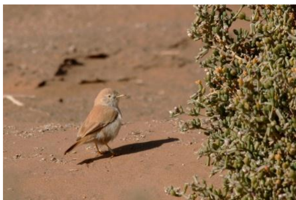
Desert Warbler, near Merzouga

We stayed overnight at the Hotel Soleil Bleu, another hotel with limited heating.