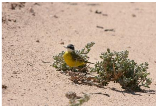
Yellow Wagtail ssp iberiae, Knifiss