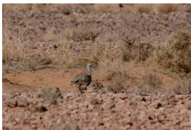
and there it is!