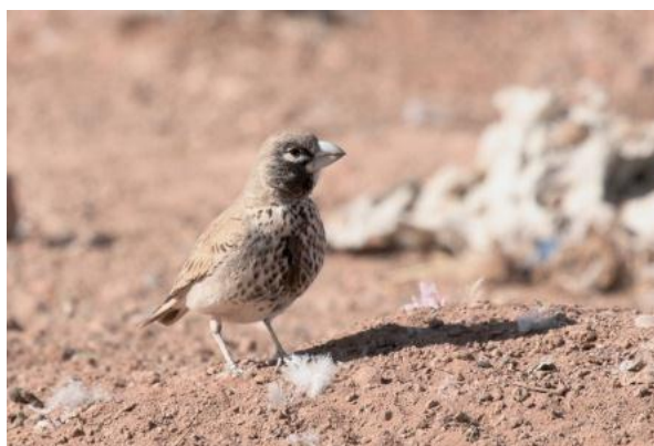
Thick-billed Lark, Tagdilt Track