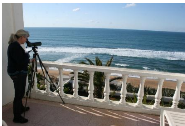
The view from our room at Vila Nora