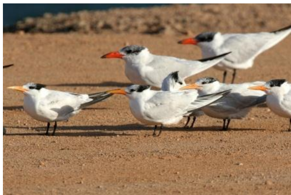
Royal and Caspian Terns, north of Dakhla

Once again we woke up to the (now) familiar sound of singing Bulbuls and House Buntings. We headed for Oued Sous, but on the way we entered the large Carrefour supermarket. Inside there were at least 3 singing House Buntings! These birds seem to be everywhere! Oued Sous holds a lot of water birds. We easily found the main target of the day, the Marbled Duck (Gosney-C p.22 site 1). Other good birds were Barbary Partridge, Stone Curlew and Moussier's Redstart, but the best was probably an immature Bonelli's Eagle. We had no problems walking all the way to the coast along the fence to the palace (Gosney-C p.22 sites 3-6). We then drove to Oued Massa, making the first major stop by the bridge (Gosney-C p.24 site 3). Only a single Brown-throated Sand Martin was present, but it showed well. Other birds included singing Cetti's and Fan-tailed Warblers. The rest of the day was spent in the Massa area, producing Little Bittern and 2 Marbled Teals (Gosney-C p.25 site 6). We then tried (Gosney-C p.24 site 4), which proved to be very productive. In 30 minutes late afternoon we found Spotted Crake, Black-crowned Tchagra, Moustached, Sedge and Cetti's Warblers and a singing Cirl Bunting. Just to the north of Agbalou Village (Gosney-C p. 25) are some stone walls surrounding the fields. We ended the day there in search of Little Owl. 2 pairs were present, one of which were mating on top of the wall of the northernmost house in the village. An astonishing way to end our birding in Morocco!