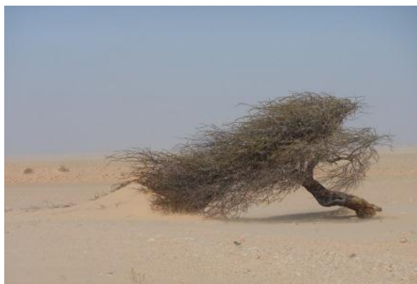
It's often windy around here