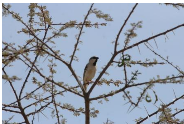
Desert Sparrow, Aousserd road km 175