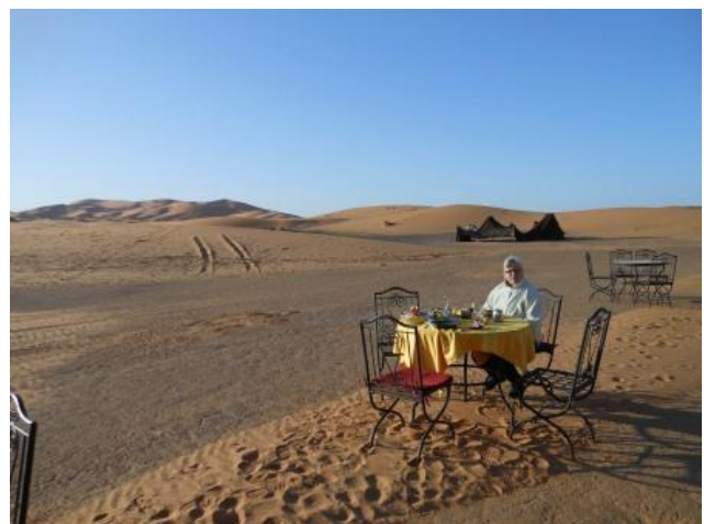
Breakfast at Auberge Caravane