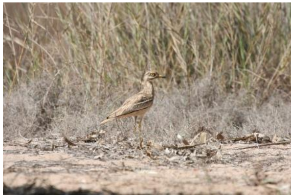
Stone Curlew, Oued Sous