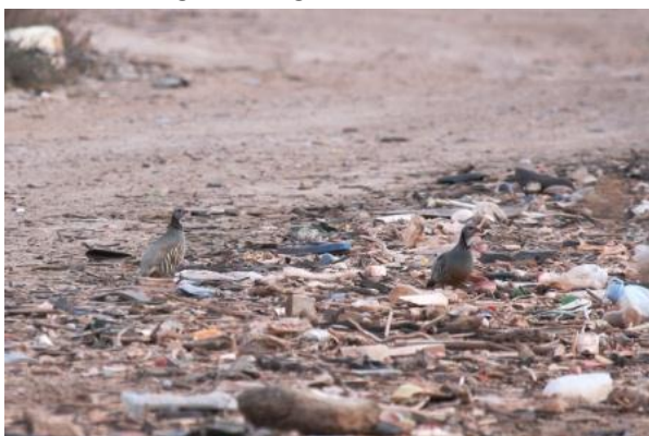
Barbary Partridge, Oued Sous