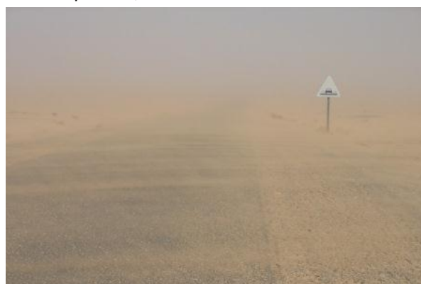
Where's the road? 35 km south of Aousserd