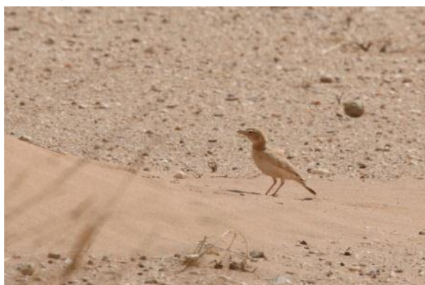
Dunn's Lark, Aousserd road km 196