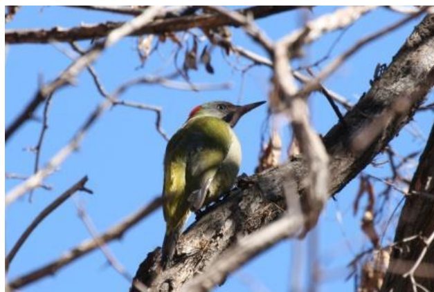
Levaillant's Woodpecker, Road to Oukaïmeden