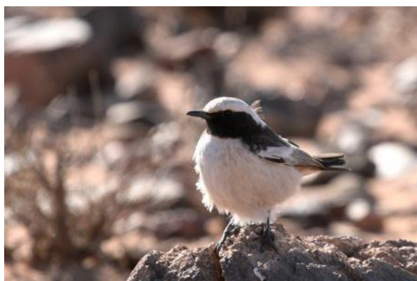
Red-rumped Wheatear, Tagdilt Track

After a short walk at the beach (Arctic Skua) we headed south towards Knifiss Lagoon (known as Naïla by the locals). Many shorebirds in the Oueds, we crossed on the way, but a Lanner perched on a pylon was the bird of the day.