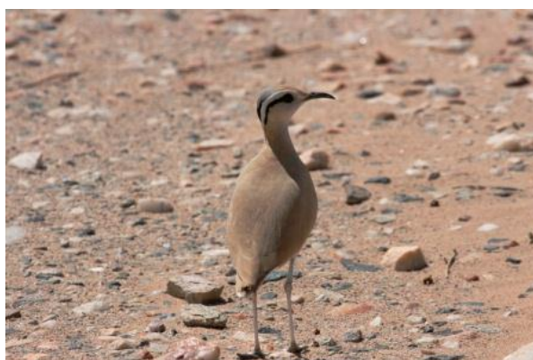
Cream-coloured Courser, Aousserd road km 145