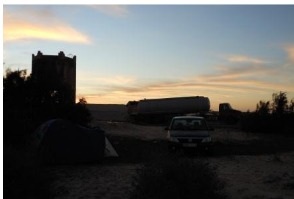
Camping at Gleb Jdiane