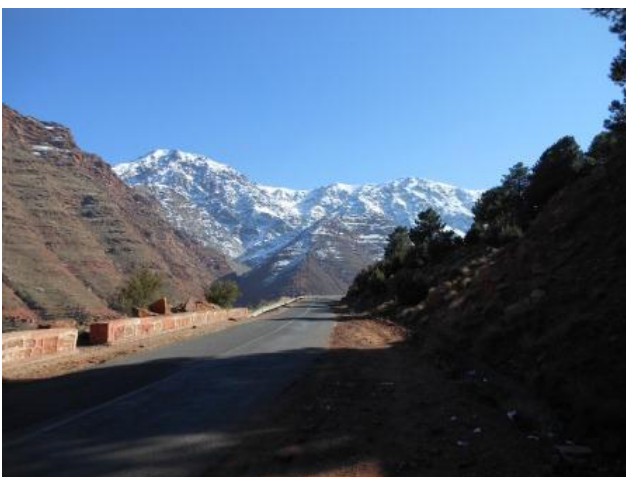
Winter on the road to Oukaïmeden

Tarfaya: Hotel Cap Juby. Nice little place with only 1 (or 2?) room. In the morning we found out, that the door was locked from the outside, the owner didn't stay at the hotel, so we actually couldn't get out! Apart from this, it's OK. 376 MAD + 52 for the breakfast.