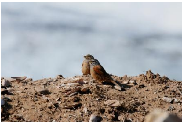
House Bunting, near Agadir

The last day was spent in Agadir, visiting the souk (quite a few House Buntings). Even at the airport, these birds were seen inside the building. Some reports mention the House Bunting as difficult to find, we found them everywhere!