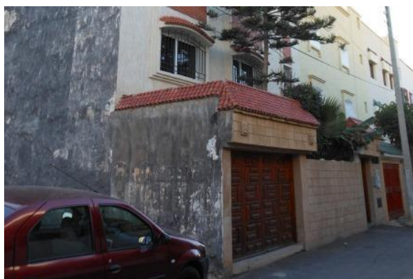
La Porte des Etoiles, you have to know it’s there!

http://www.tripadvisor.co.uk/Hotel_Review-g293731-d2102903-Reviews-La_Porte_des_Etoiles-Agadir_Souss_Massa_Draa_Region.html