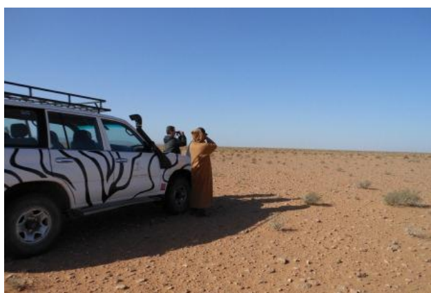
Searching for the Houbara...

The rest of the day we birded the Rissani area with Brahim Mezane. Ruddy Shelduck, Hoopoe Lark, Bar-tailed Lark, Maghreb Lark, Fulvous Babbler and Spectacled Warbler were new to the tour list.