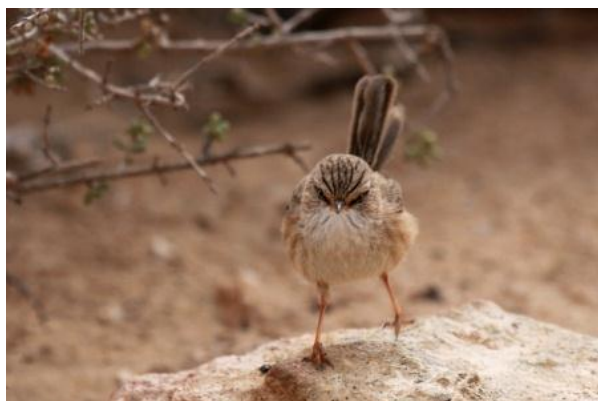
Scrub Warbler ssp. theresae, Knifiss

22 km after the turn off towards Aousserd we camped at Gleb Jdiane (N 23.61303 W 15.72344). This is a well-known drinking site for both Spotted and Crowned Sandgrouse. The place is actually a water well, and a lot of lorries collect water there. The Spanish-speaking warden is very kind and knew right away, what we were there for. We had wondered, what makes people settle in such a remote place, and he probably gave us the answer. When we asked him, if we were allowed to camp in the area, he said something like "of course, you can camp where ever you want, out here we have freedom!"