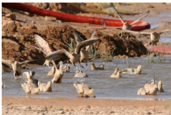
Spotted Sandgrouse, Gleb Jdiane

At Km 191 we arrived at Oued Jenna, got stuck in the sand, pulled out by a friendly lorry driver, set up the tent and started birding the area. 2 males and a female Black-crowned Finch-Lark were the best birds. All day we had listened for the characteristic sound of the Cricket Warbler, but no luck.