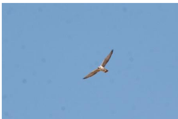
Lanner, Aousserd road km 175