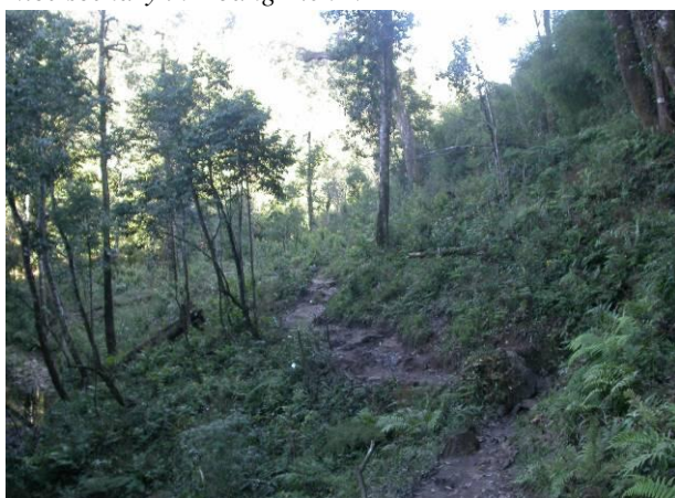
Forest destruction in Hoang Lien NP