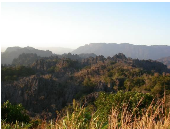
Limestone forest west of Na Hin

We stayed at the Mi Tuna Guesthouse. But the restaurant is no longer open. There are a lot more guesthouses in the village. These are probably a better option.