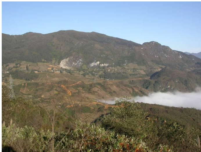
View in the direction of O Qui Ho Road

We only had 1 bigger flock of forest species. But the good species are still around. We did not go on the side tracks. The dense fog made that we stayed on the main road.