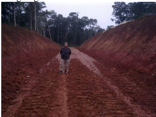
Road construction in Deo Mang Den.

I just have 2 comments on this place. Large road improvements were started at the side track. When driving to Dak Tang (to the north) along the main road, logging was going on almost everywhere, but luckily not yet on the places for the Chestnut-eared Laughingthrush.