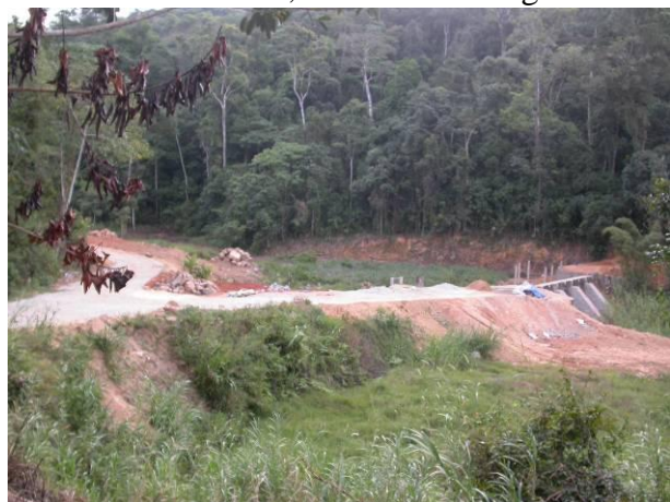
Recent constructions in Ta Nung Valley