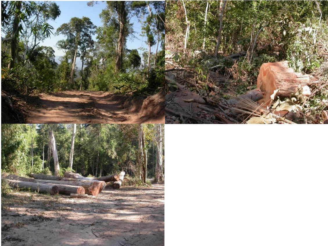
Logging in forest east of Na Hin

In the forest on the limestone, west of the village, birding was much more productive. The 2 targets, Bare-faced Bulbul and Sooty Babbler were seen. Easy roadside birding.