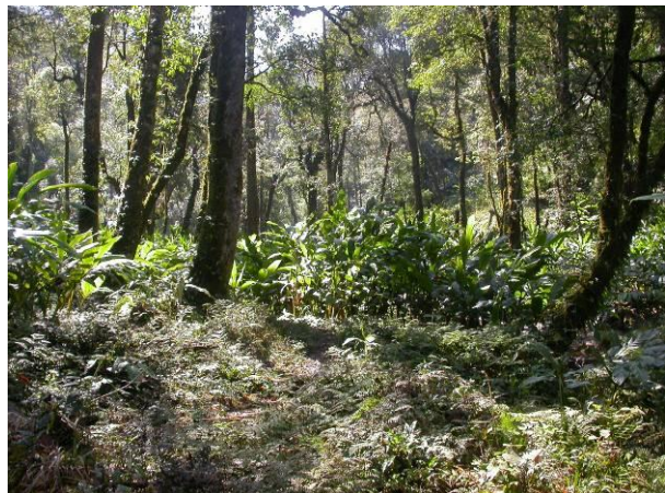
Cardamom plantation in Hoang Lien NP