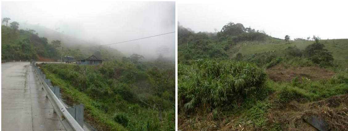
Lo Xo Pass

Probably is it necessary to go on the Dak Blo Road to have a chance for Crested Argus and Red-tailed Laughingthrush but all the other species are possible along the main road.