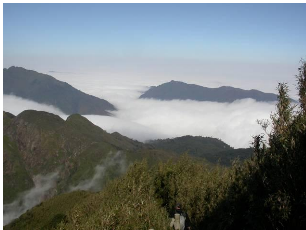
Nice scenery in Hoang Lien NP

In this national park, forest destruction is going on. On the flanks of the streams at the lower parts of the Fansipan Trek and in Ward's Valley, all the undergrowth is cut down for cultivating cardamom. We saw bamboo and other scrub that was cut down only a few days ago. White-throated Wren-Babbler did already disappear from the area and I think that other species, like Pale-throated Wren-Babbler, will also disappear in the future when this destruction is going on.