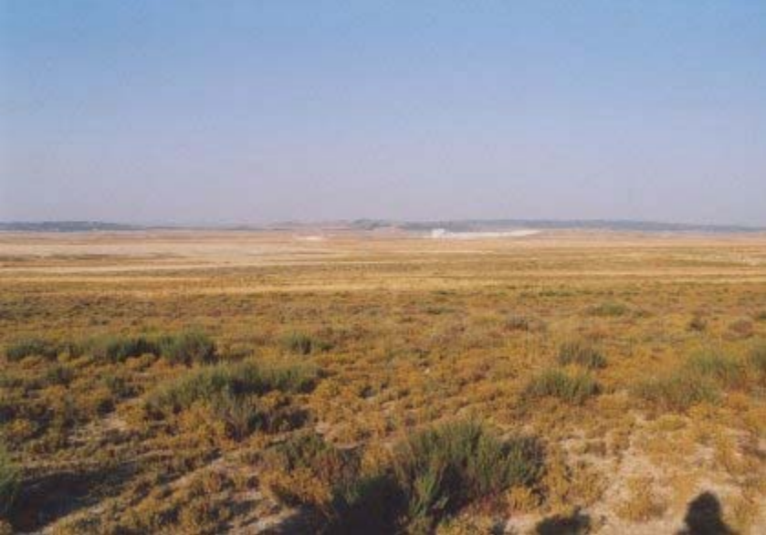
The road crosses a tributary of the Ebro just west of Caspe (at Chiprana). We stopped briefly for a Purple Heron and added Short-toed Eagle (pair) to the list. Our other stop was just north first stage across the steppe yielded 6 Bee of Montnegre on the Río Cinca where it merges with Ebro. We saw 19 Little Egrets (all flying downstream), a Squacco Heron, a Night Heron and heard Reed and Cetti's Warblers here. Next stop Barcelona.

Dips: we can't complain given the short time used on this area.