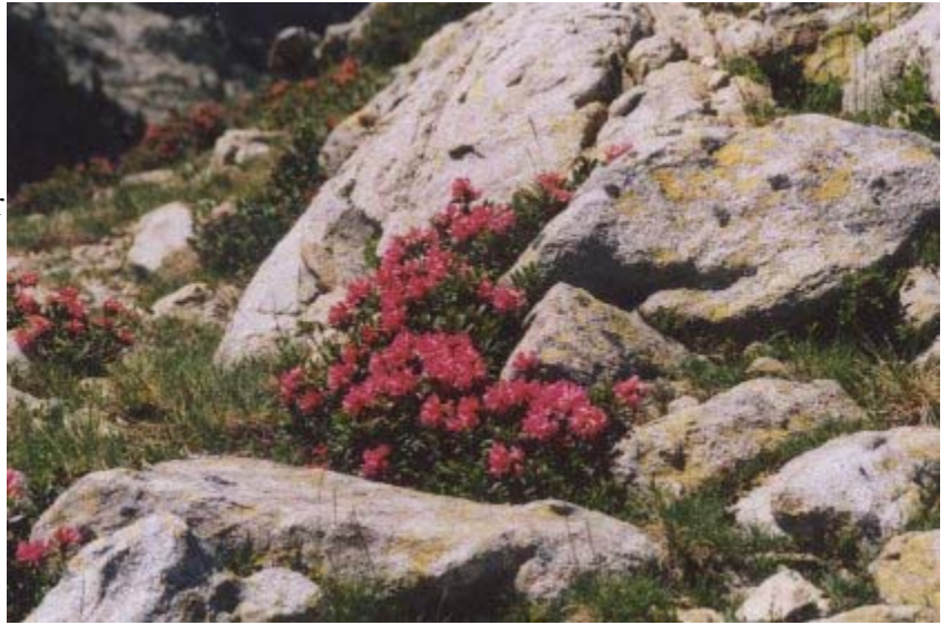
Riglos - 20^{th} and 23^{rd} June 2003